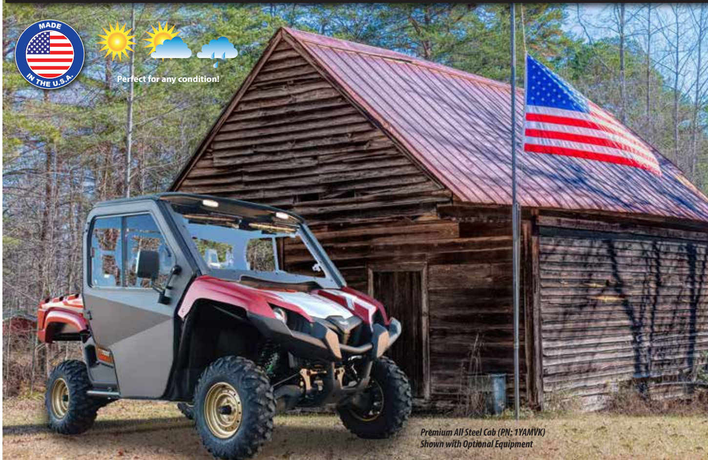
Premium All Steel Cab (PN: 1YAMVK) Shown with Optional Equipment