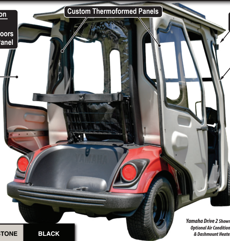
Yamaha Drive 2 Shown with Optional Air Conditioning & Dashmount Heaters

Unique Curtis Glide N' Ride Parallel Opening Doors