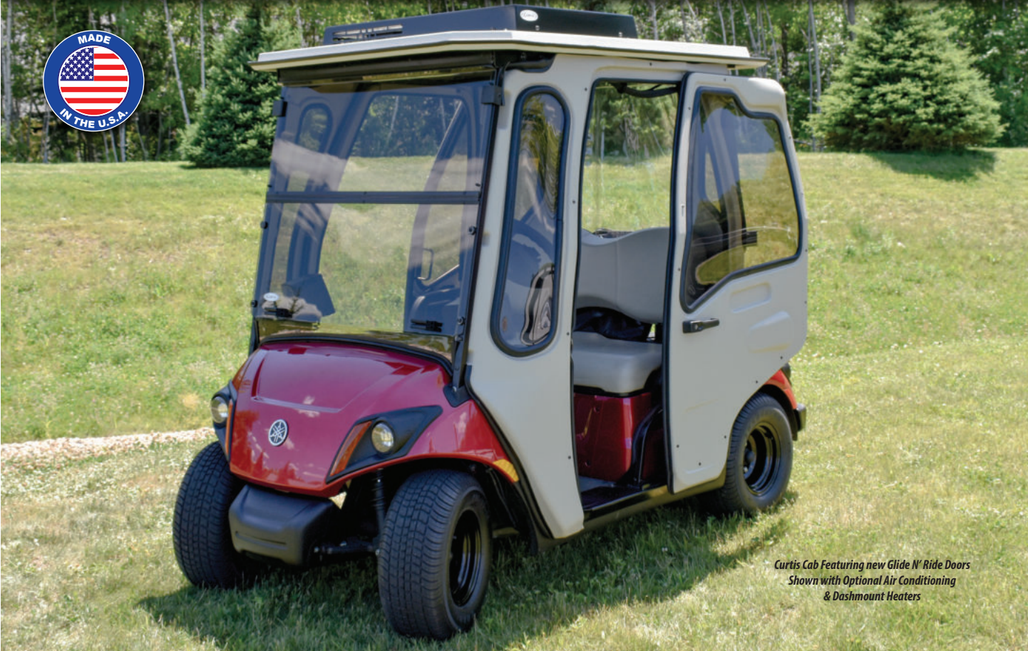
Curtis Cab Featuring new Glide N' Ride Doors Shown with Optional Air Conditioning & Dashmount Heaters