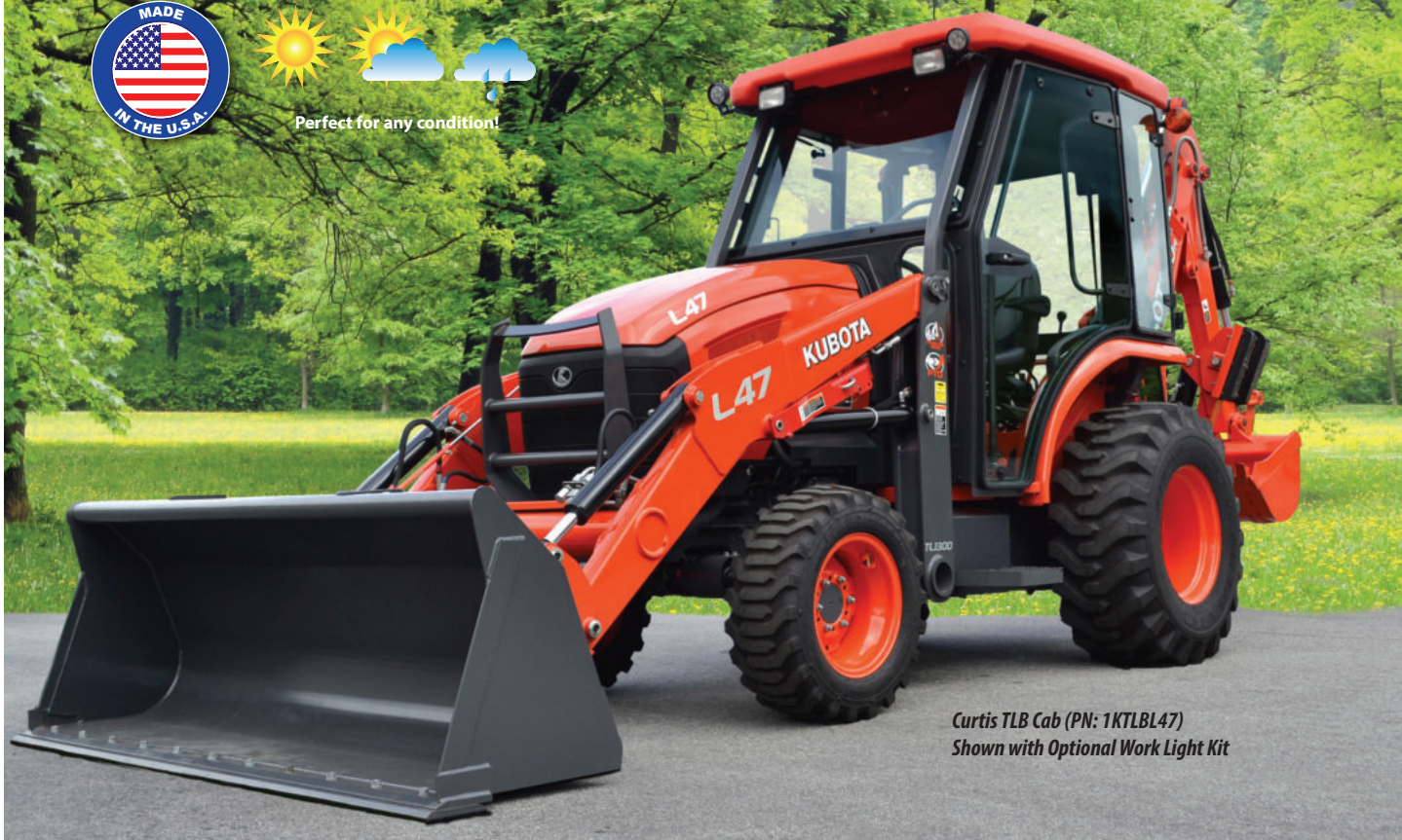
Curtis TLB Cab (PN: 1KTLBL47) Shown with Optional Work Light Kit