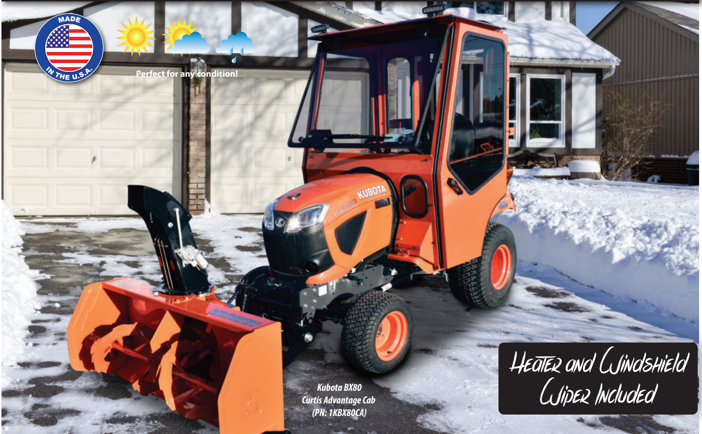
Kubota BX80 Curtis Advantage Cab (PN: 1KBX80CA)