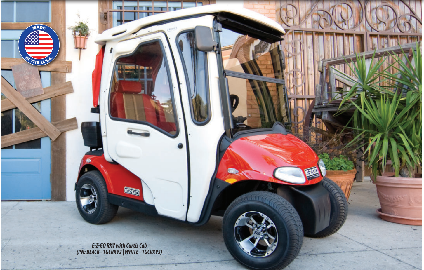
E-Z-GO RXV with Curtis Cab (PN: BLACK - 1GCRXV2 | WHITE - 1GCRXV5)

Cab Fits Gas or Electric Vehicles thru June of 2022