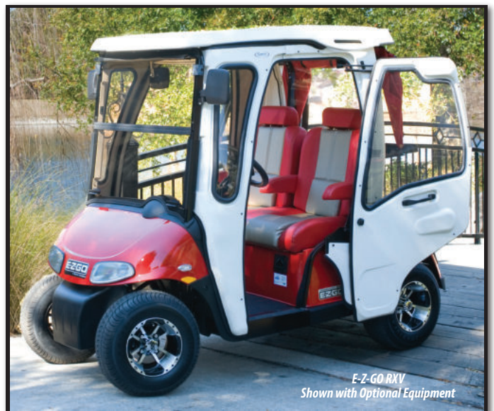
E-Z-GO RXV Shown with Optional Equipment