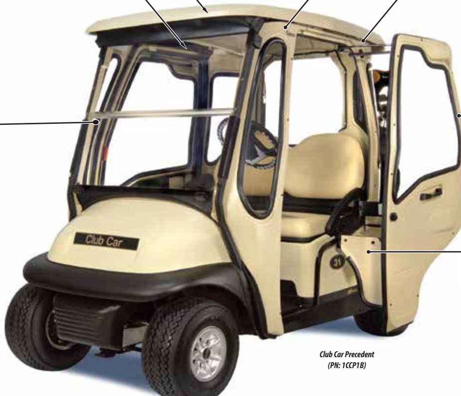
Club Car Precedent (PN: 1CCP1B)

Unique Curtis Hinge Engineered for Parallel Opening Doors