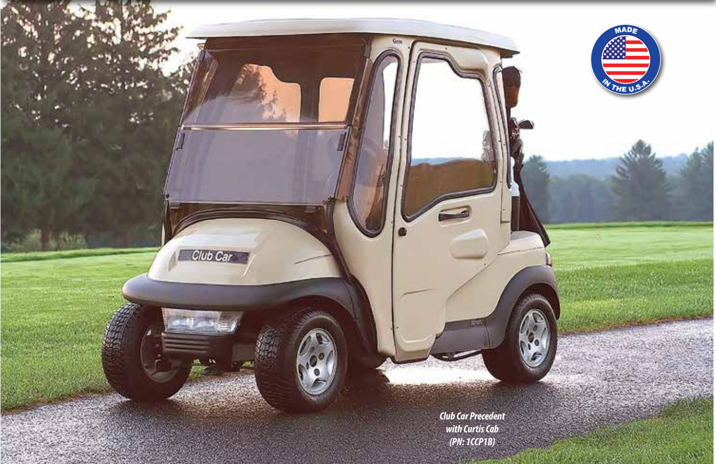
Club Car Precedent with Curtis Cab (PN: 1CCP1B)