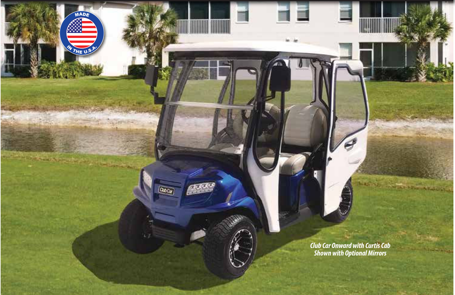
Club Car Onward with Curtis Cab Shown with Optional Mirrors