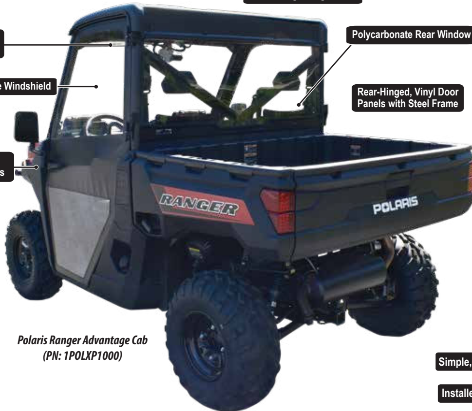
Polaris Ranger Advantage Cab (PN: 1POLXP1000)