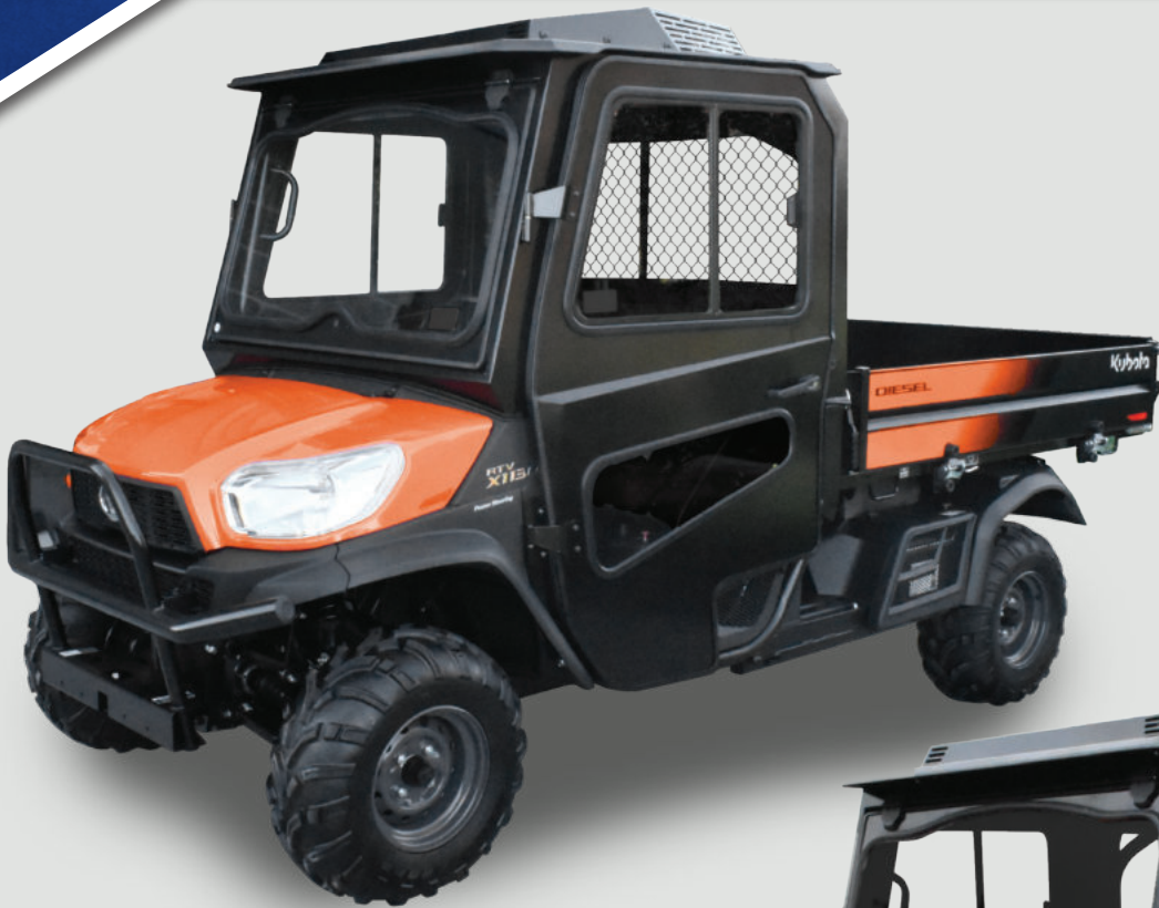
Curtis Air Conditioning on Kubota RTV-X Crew (X1140) & Kubota RTV X1130